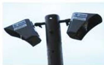
Externally Mounted Cameras