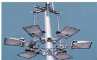
High Mast Lighting