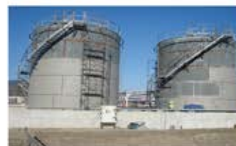
Petrochemical Storage Facility